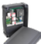
P-600D703 230/400 V electronic control unit for one gate operator with electrical brake (P-500MASTER20T)