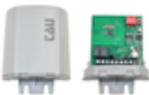
P-900TWM Master receiver for central interface (manages up to max. 4 TWCs).