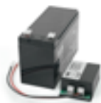
K-200KB4 Battery charger and backup battery kit