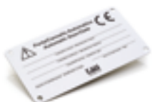
C-TARG Aluminium CE mark label, self adhesive