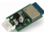
P-250T-WIFI Device for Wi-Fi connection 2,4 GHz to allow the smartphone to remotely control and program the control units via TauApp. ( P-500MASTER20T excluded )