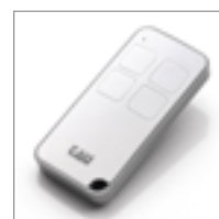
Further accessories: Transmitters page 238 Photocells page 243 Flashing lights page 246