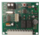
P-250RXSM2 Self-learning, two-channel, 433,92 MHz plug-in radio receiver. Accepts up to 14 rolling code transmitters