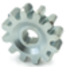
M-ING0MSTZ12 Pinion module 6