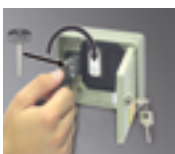
P-650ESE02 External emergency release device (flush-mounted) with tamper-proof housing and 4 m cable