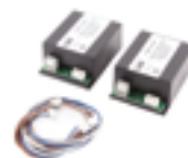
P-900T-COMM Interface for connecting 2 opposite sliding gate automation in master/slave mode ( P-500MASTER20T excluded )