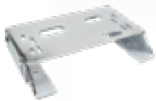
P-550CPMR Adjustable counterplate from min. 65 mm to max 94 mm