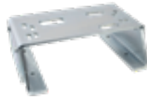
P-550CPMR1 Adjustable counterplate from min. 124 to max 202 mm