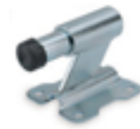
P-700BAP4 Gate stopper with spring