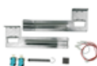
P-500MASTERKITFC Electromechanical limit switches kit for MASTER.