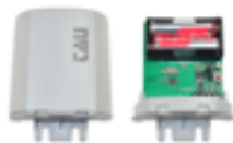
P-900TWC Battery-powered wireless slave transmitter for mobile/fixed sensitive edge (manages up to max. 2 sensitive edges per TWC).