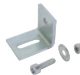
P-400VSF20 Screws and brackets for P-400CFZ22 (40 units per pcs)