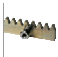
Accessories for MASTER series Page 44

400 V three-phase sliding gate operator with encoder without electronic control unit. Max. gate weight 2000 kg.